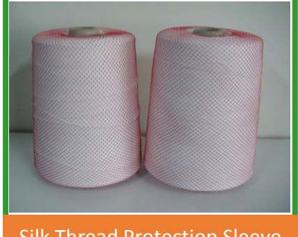
Silk Thread Protection Sleeve