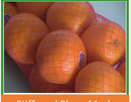
Stiffened Plane Mesh